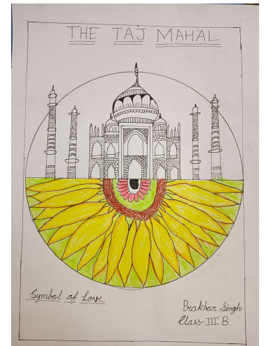
Prakhar Singh III B