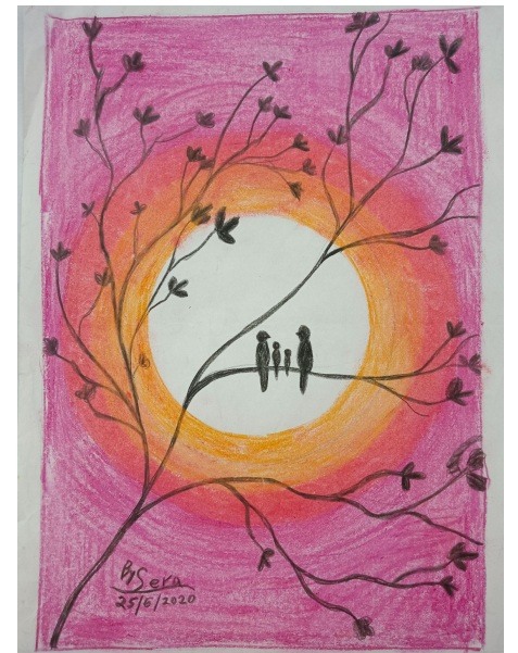
Sera III B