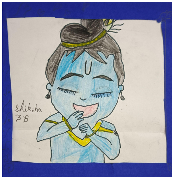
Shiksha harijan III B