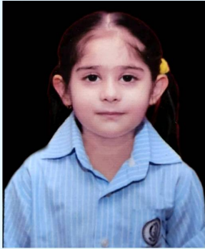
Aviva Dixit II Football